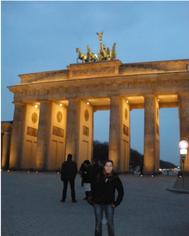
Bradenburg tower (gate)